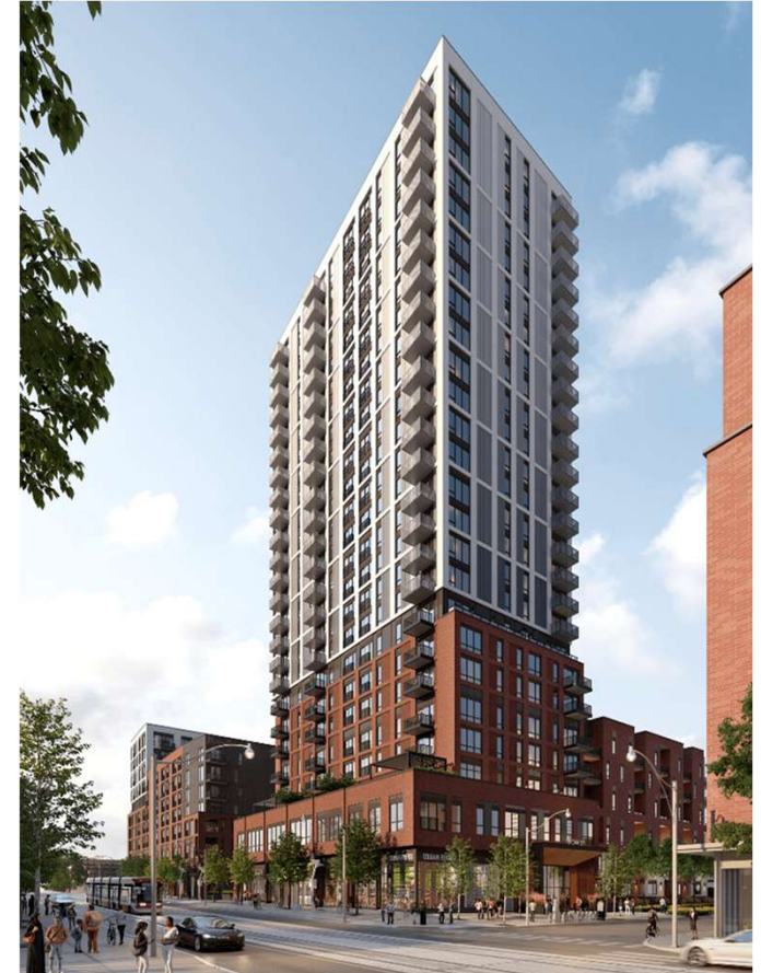
Oak House / Daniels on Parliament