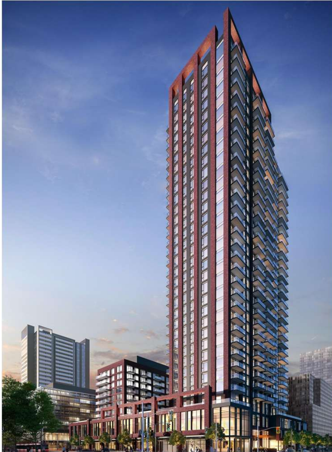
River House / Artwork Tower